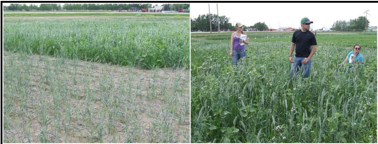
Fig. 3. Triticale monoculture (left foreground) suffering severe water stress while triticale sown with other species (background and right) is powering. In addition to triticale, the 'cocktail crop' contained oats, tillage radish, sunflower, field peas, faba beans, chickpeas, proso millet and foxtail millet. Chinook Applied Research Association (CARA), Oyen, Alberta.

In my travels I've seen many examples of monocultures suffering severe water stress while diverse multi-species crops beside them remained green (Fig. 3).